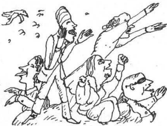
In Ashikaga, Japan, people participate in the Akutare Matsuri, or the Festival of Abusive Language. They climb a hill to the 1,200-year-old Saishoji temple while screaming curses and railing at employers, teachers, politicians. After that catharsis, they welcome the new year with ceremonies in the temple to allow happiness to flow in the coming months.