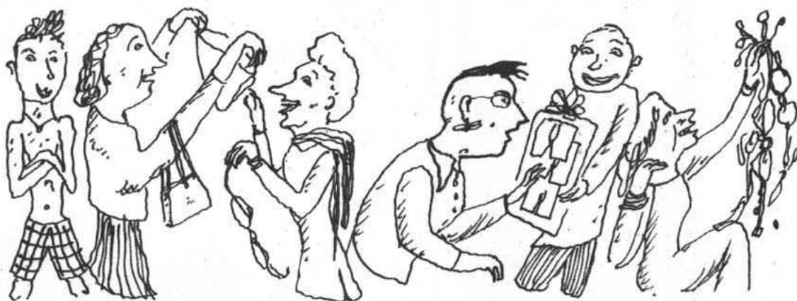
Buying and wearing new clothes, especially in red or yellow, is a common ritual. In Venezuela, people give each other yellow underwear to wear into the new year for good luck.