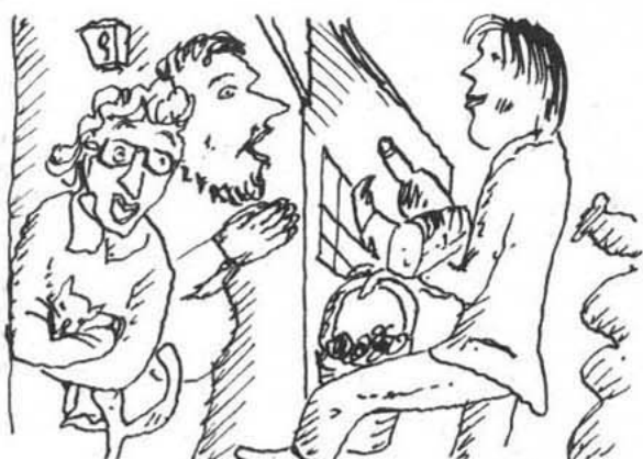
In Britain and Ireland, the first person to cross the threshold on New Year's Day is considered to be a harbinger of the household's luck for the year. Tradition holds that the "first foot" should belong to a tall, healthy, strapping dark-haired man, carrying symbols of abundance for the home: coal for the fire, bread for the table and whiskey for the head of the household.

The beginning of a new year has been celebrated in some manner for more than five millennia. While traditions differ across cultures and many regional variations have evolved, most rituals that accompany the holiday are intended to symbolically purge the old year or to ensure good times in the new one.