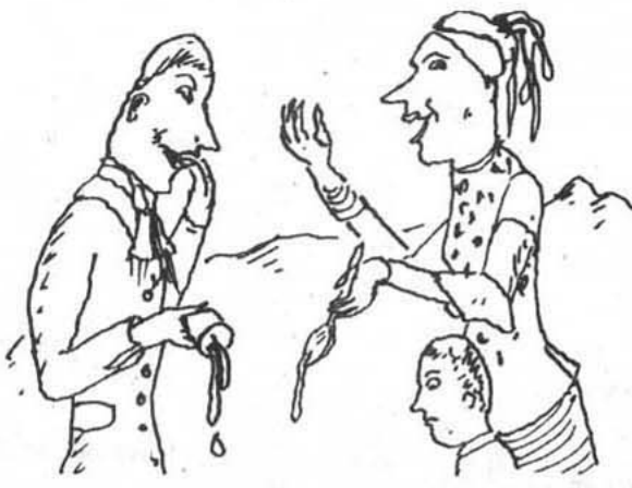
On New Year's Day in parts of Switzerland, people allow a drop of cream to hit the floor, to ensure overflowing abundance in the coming year.