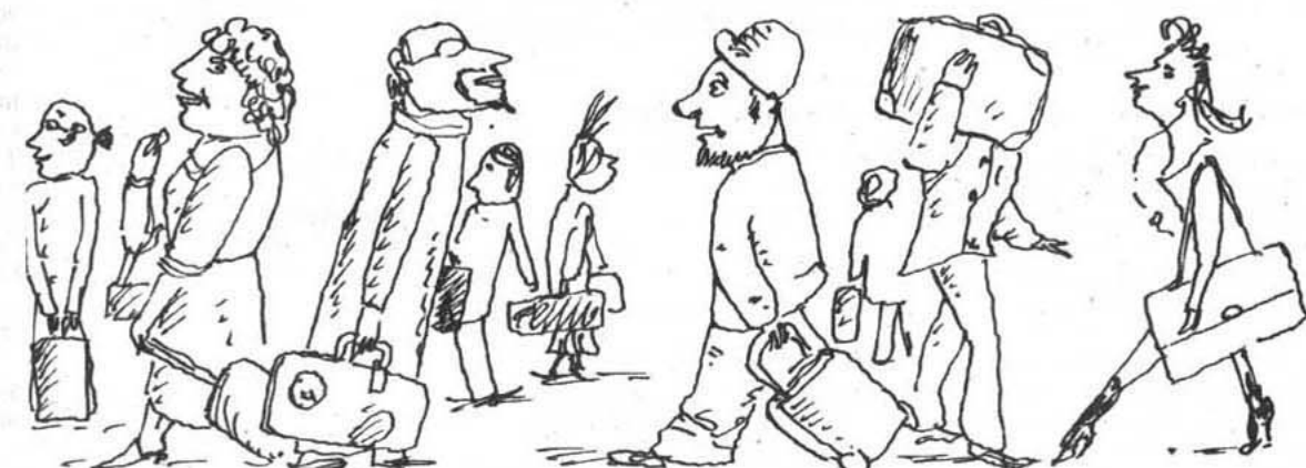
Colombians and other South Americans who would like to travel in the coming 12 months walk around their house with a suitcase.