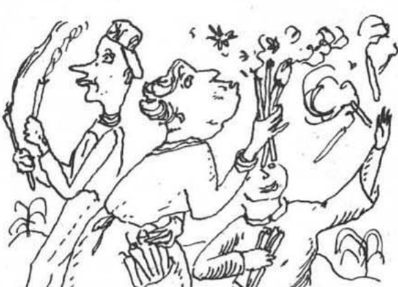
In many cultures, fireworks are a symbol of light in the new year. While they are restricted the rest of the year in Iceland, on New Year's Eve anyone and everyone can light the explosives.