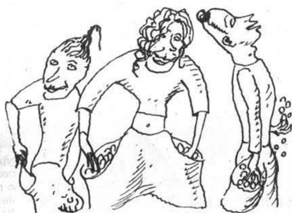
Many Filipinos wear new clothes with deep pockets. They fill their pockets with coins and fresh bills on New Year's Eve, and at midnight, they shake them noisily to attract prosperity in the coming year.