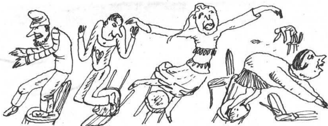
At midnight, the Danes make a wish as they jump off chairs — literally leaping into the new year.